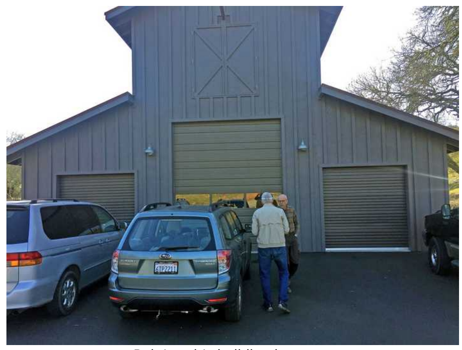
Bob Leach's building barn